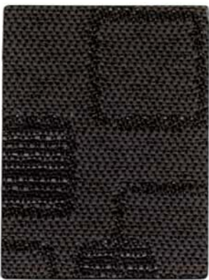
SHUFFLE GRADE 5 BLACK