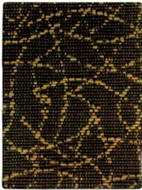
TRACERY GRADE 6 SHADOW