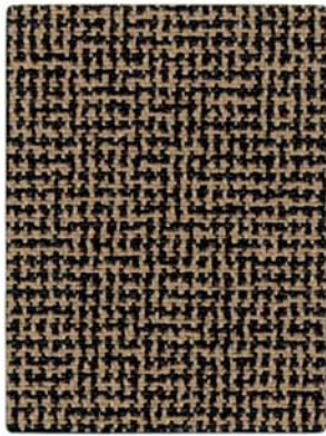
METRO GRADE 5 GYPSUM