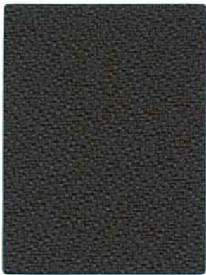
OPEN HOUSE GRADE 3 CHARCOAL