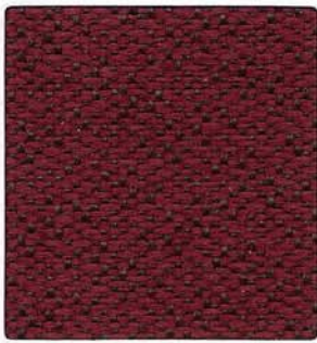
AVON GRADE 2 BURGUNDY