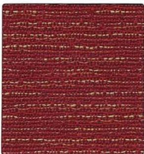
FANDANGO GRADE 2 APPLE