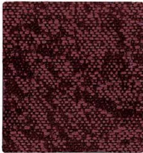
PUTNAM GRADE 2 CRANBERRY