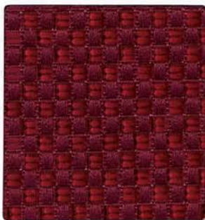
PERK GRADE 2 CRIMSON