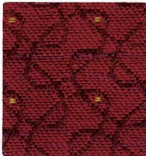
TRANSPORT GRADE 2 BURGUNDY